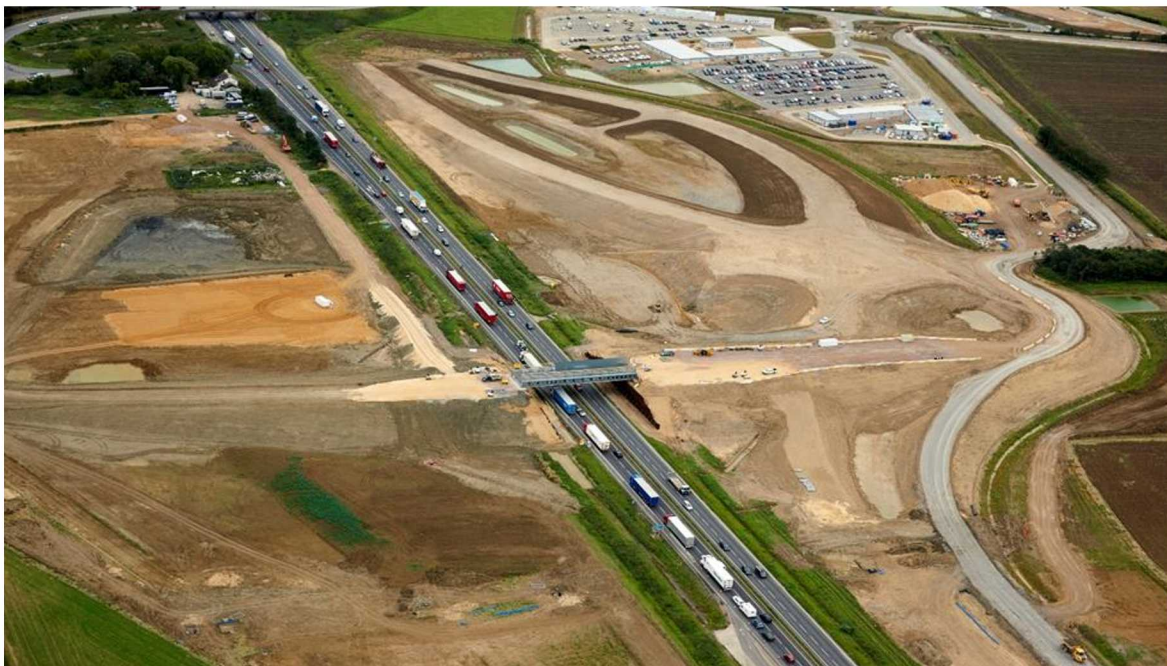
Bailey Bridge over the A14 at Swavesey

Section 4 & 5: The Bailey bridge at Swavesey is fully operational. We aim to transport approx. 10,000 tonnes of materials daily across the bridge from south to north using 40 tonne dump trucks. If the weather remains dry, we will have moved all the required materials by the end of October 2017. Following this operation, the bridge will be relocated to another location over the A14, towards the Girton junction. Work on the bridge abutments at the next location has already commenced.