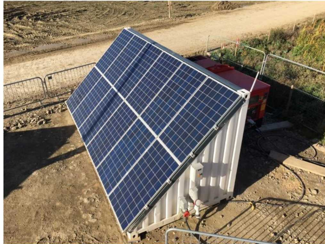
Solatainer® Solar Panels