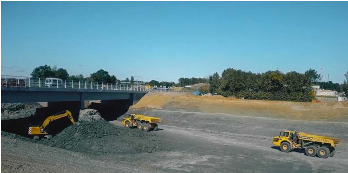
The New Ermine Street Bridge

Section 4 & 5: The Bailey bridge at Swavesey is fully operational. We aim to transport approx. 10,000 tonnes of materials daily across the bridge from south to north using 40 tonne dump trucks. If the weather remains dry, we will have moved all the required materials by the end of October 2017. Following this operation, the bridge will be relocated to another location over the A14, towards the Girton junction. Work on the bridge abutments at the next location has already commenced.